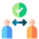
AUTHORIZED USER CONTACT INFO