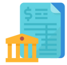
BANK ACCOUNT STATEMENTS