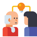
YOUR TRUSTED ADVISORS