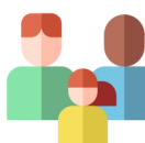
TRUSTED FAMILY/FRIENDS RESOURCES:

Create a calendar to remind you to revisit your budget, credit report and other documents every year.