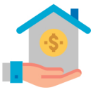
MORTGAGE STATEMENTS, HELOC, TITLE