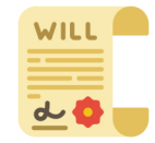
WILL, TRUST, HEALTHCARE DIRECTIVES