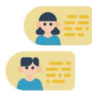
EMPLOYER INFO, CONTACTS